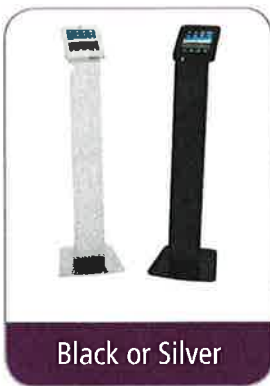
Black or Silver