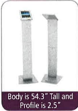
Body is 54.3" Tall and Profile is 2.5"