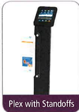
Plex with Standoffs