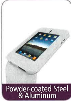
Powder-coated Steel & Aluminum