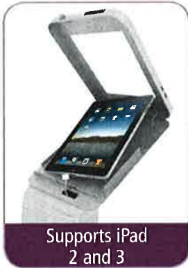
Supports iPad 2 and 3